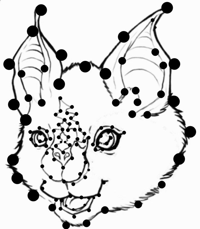
Popo kiatu-farasi wa Geoffroy