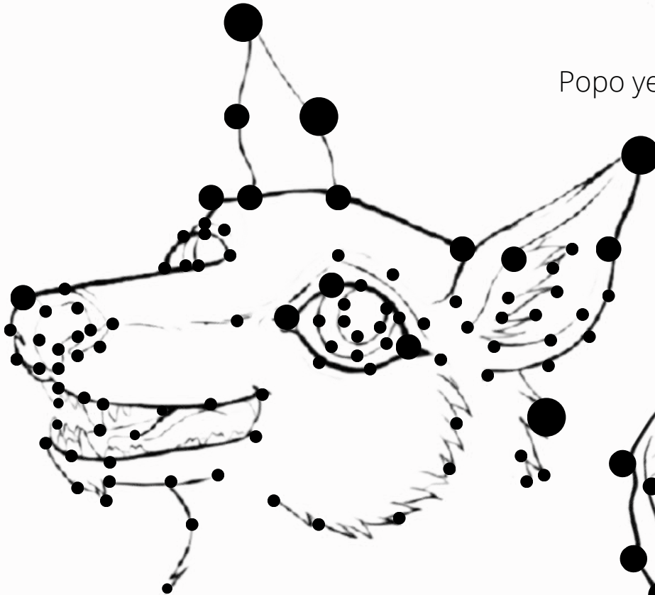
Popo wa rangi ya majan na mla matunda.i