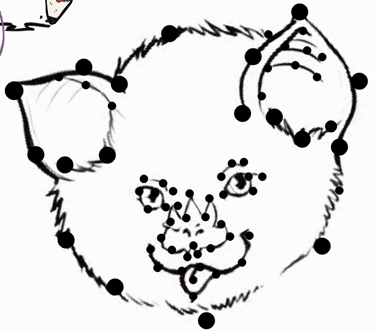
Popo yenye masikio mafupi ya Percival